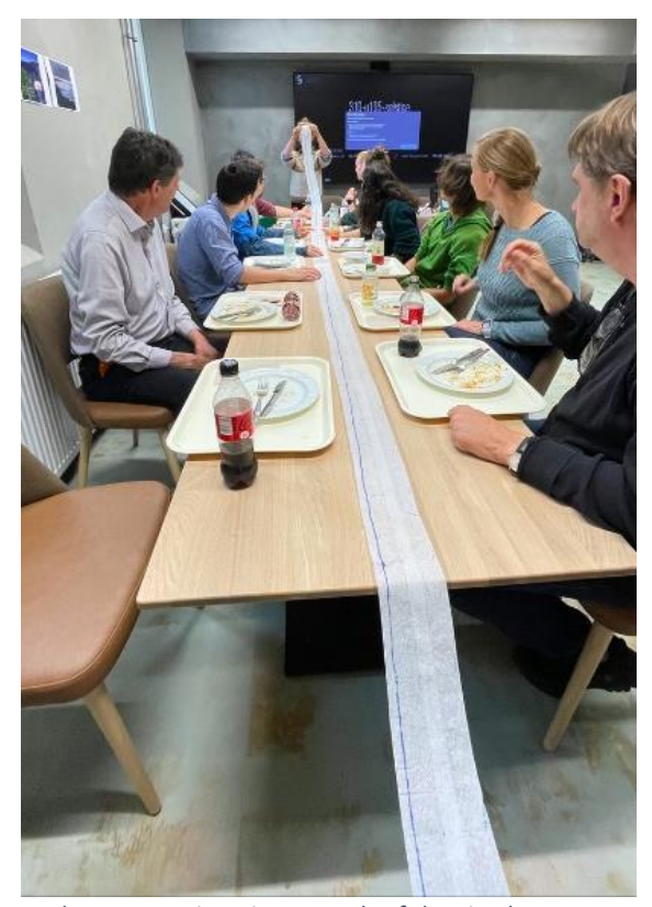
Figure 0.2. Communicating climate change. Here is a nice example of showing how temperature has changed over a very long time - a linear time scale of global warming inspired by the xkcd comic: <a href="https://xkcd.com/1732/">https://xkcd.com/1732/</a>