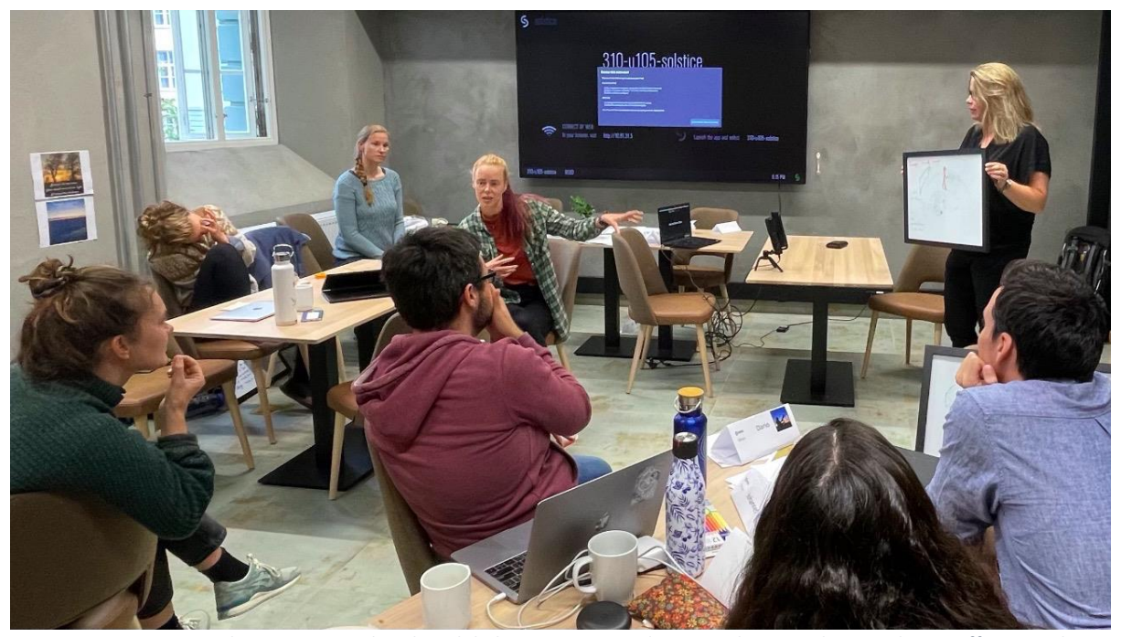
Figure 0.3 Practicing explaining topics related to global warming. How do you explain e.g. the greenhouse effects or why it rains more in Bergen now than 20 years ago?