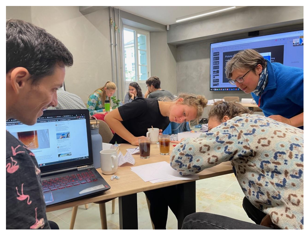
Figure 0.1: Making fortune tellers for outreach and teaching purposes and also playing with coffe from inspiration by an example fortune teller.